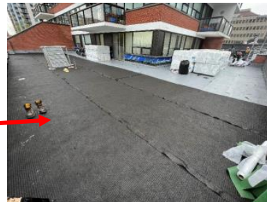
Drainage board applied