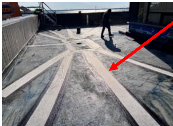
Waterproofing to seal seams

After the concrete had set then the waterproof membrane was applied.