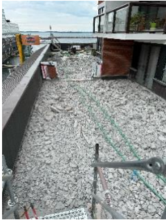
The surface was broken into small pieces with jackhammers and disposed of through the yellow chute

The following pictures show the process that was followed to date during the rehabilitation: