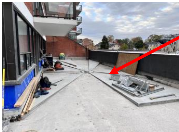
Wooden forms being laid down

Once the rubble was removed and the concrete slab was cleaned up, the new forms were laid down to mold the new concrete pour and ensure that a proper slope to the new drains was achieved.