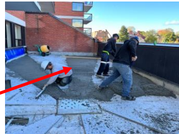
New concrete with slope to drains

After the concrete had set then the waterproof membrane was applied.